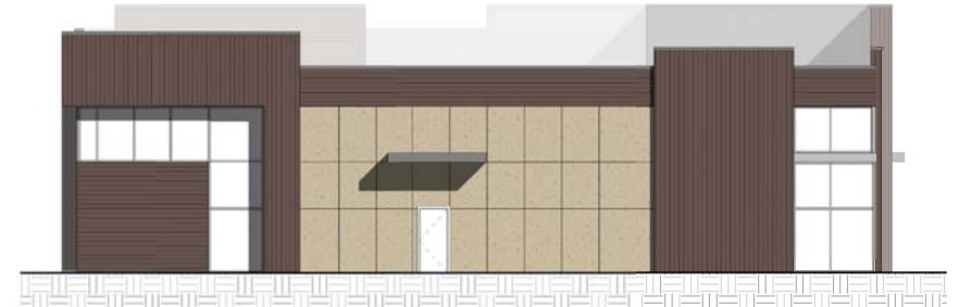
② BLDG B - NORTH ELEVATION 1/8" = 1'-0"