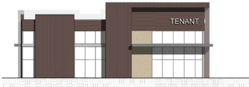
③ BLDG B - WEST ELEVATION 1/8" = 1'-0"