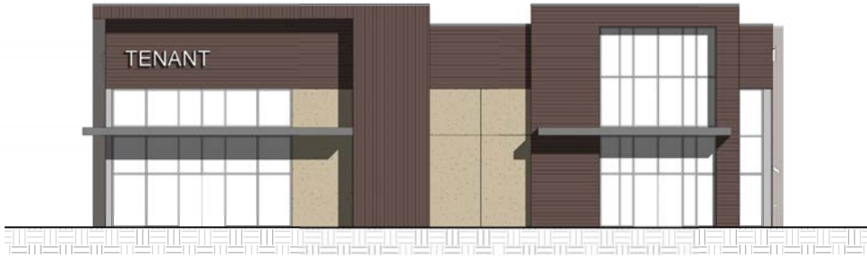
① BLDG B - SOUTH ELEVATION 1/8" = 1'-0"