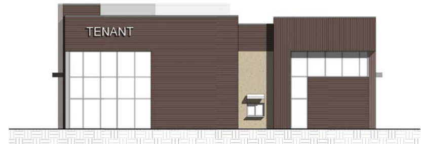
④ BLDG B - EAST ELEVATION 1/8" = 1'-0"